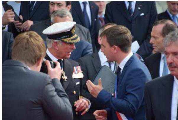
June, 6th 2014 – D DAY Landing beaches 70th Anniversary, on the beach of Ouistreham Riva-Bella

Press conference Tuesday April, 4 th 2017, from 9h15 to 10h AM