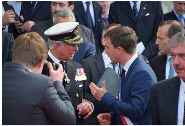
June, 6th 2014 – D DAY Landing beaches 70th Anniversary, on the beach of Ouistreham Riva-Bella

On January 18 th 2017, after the vote of all the municipal Councillor, the city of Ouistreham Riva-Bella launched an architects competition for the construction of the Franco-British Visitors Centre on Sword Beach, in Ouistreham Riva-Bella.